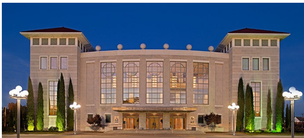
The Harrison Opera House Norfolk, Va