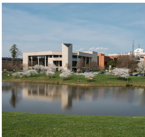
Center for the Arts, George Mason University, Fairfax, Va