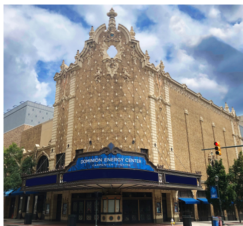
Carpenter Theatre in the Dominion Energy Center Richmond, Va